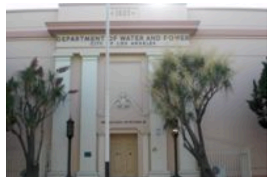
Distributing Station 41 In service Feb. 1, 1937