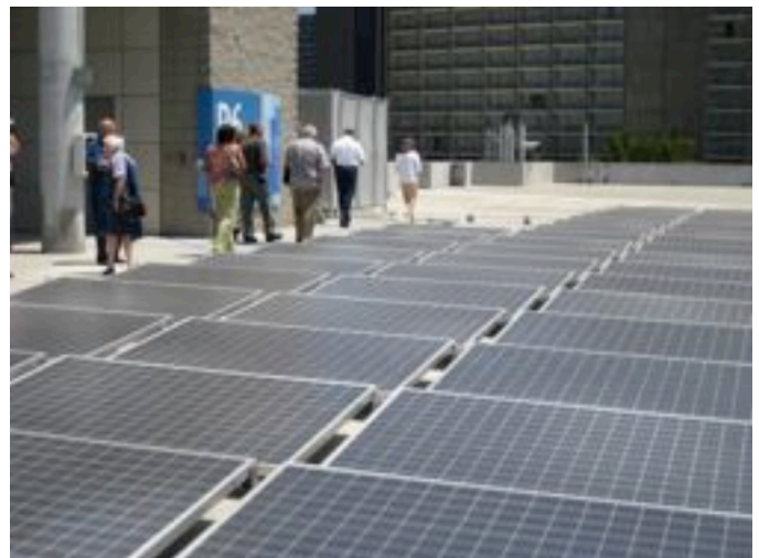
A walk by the rooftop solar panels from which there is a panoramic view of Sun America, MGM, Century Plaza Hotel, Westfield Shopping Center, other landmarks and views of surrounding cities.