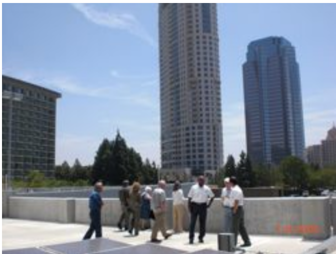
MGM solar panels, Associates, Guides, and the Century City sky line.

During our tour, the system was producing 327 kW (at 1 pm) and is expected to generate over 570,000 kWh annually. The system produces DC current that is converted onsite to AC to operate in parallel with DWP's service. ❖