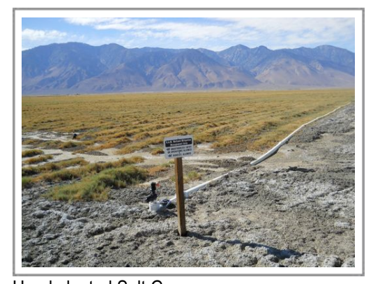
Hand planted Salt Grass