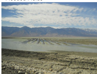
Tillage in Flooded Field