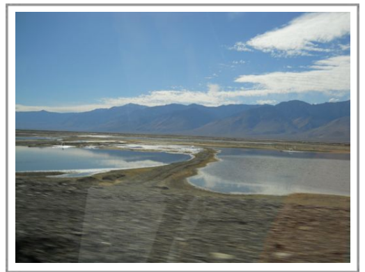
Flooded Fields Dust Mitigation

As you can see from the accompanying pictures, this is a remarkable program. And, it has some salutary side benefits. Each separate mitigation project has the potential for employment for local residents. Excavating the site for soil preparation has provided Indian artifacts which are fodder for university historians and evidence of how shallow the lake has been at other times when Indian villages occupied some of its sometime bed area. This last is an argument for limiting how much of the lake should be included in any rewatering area. In addition, the purchase of building supplies, tools and equipment, from ploughs to solar panels, provides additional commerce for the Inyo business communities.