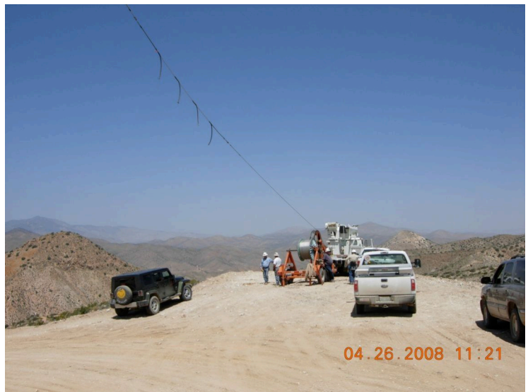
Stringing Fiber Optic Ground Wire on Transmission Line

The Transmission will have the following characteristics: