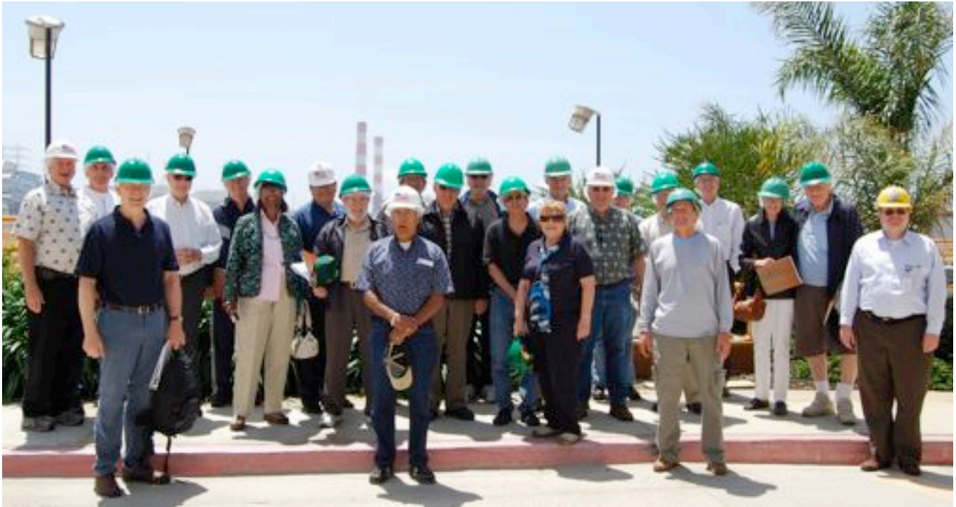
Hyperion/West Basin Tourists ~ Wednesday, May 14, 2008. Pictured left to right.