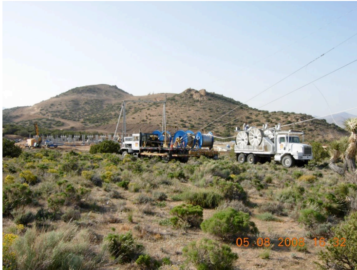
Stringing Conductor Outside Wind Collector Station