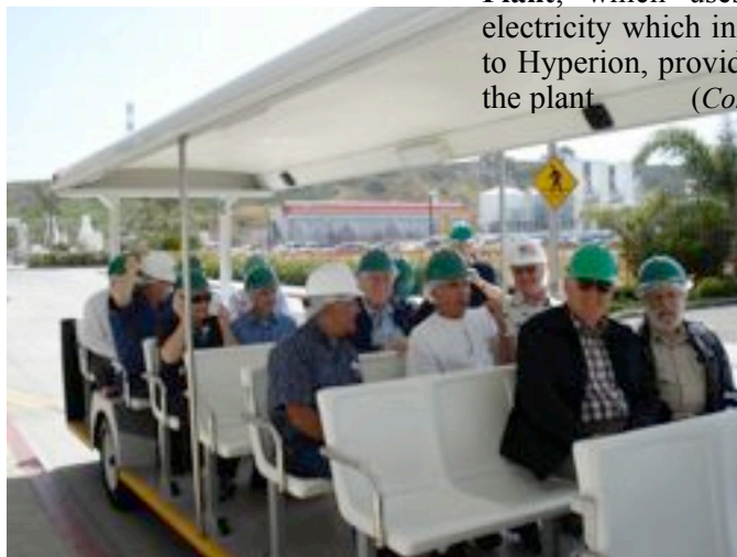
Hyperion Tram transportation for our group as tourists/guests