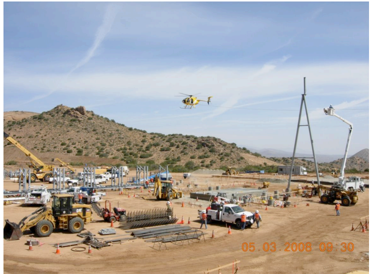
Helicopter installing pulling lines

DWP Quality Assurance personnel witness installation of all aspects of construction including: roads, foundations, structure erection, conductor stringing, sagging, and dead ending in addition to developing correction lists prior to final acceptance. ✱