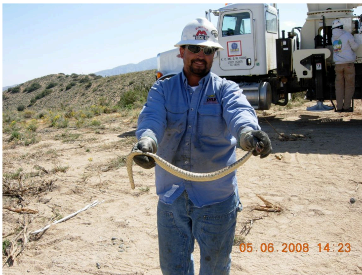
Line worker with Rattle Snake